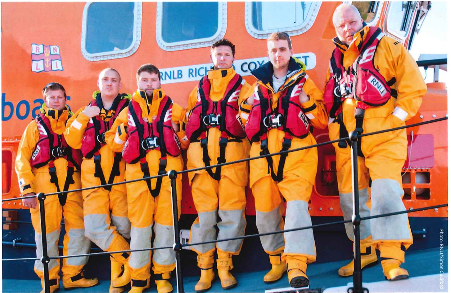
Above: Falmouth all-weather lifeboat crew